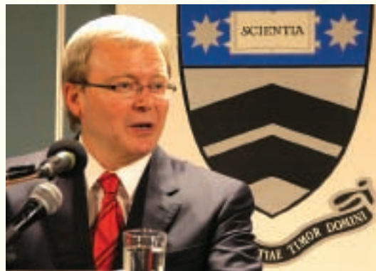
Labor frontbencher Mr Kevin Rudd MP delivers his address

Christians should be engaged, active and outspoken about the great challenges that face Australians today, argued Kevin Rudd.