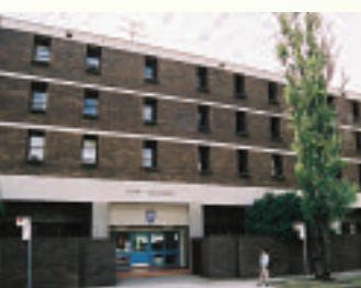
New – then and now