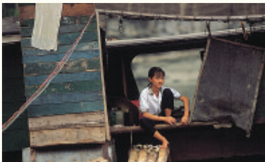
An example of urban poor housing

implementable definition of sustainable development; two the lack of research into affordable housing policy in Malaysia from a social sustainability perspective and three, the lack of reliable data pertaining to sustainable and affordable housing for the urban poor in Kuala Lumpur."