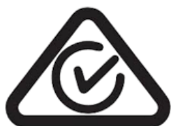
Australian Safety symbol

Below is the acceptable safety standard symbol you should look out for on your electrical equipment. Please note the safety symbol does not negate the requirement for maintenance to check the appliance first. (The CE qualification is the only other certification accepted in the college alongside the Australian)